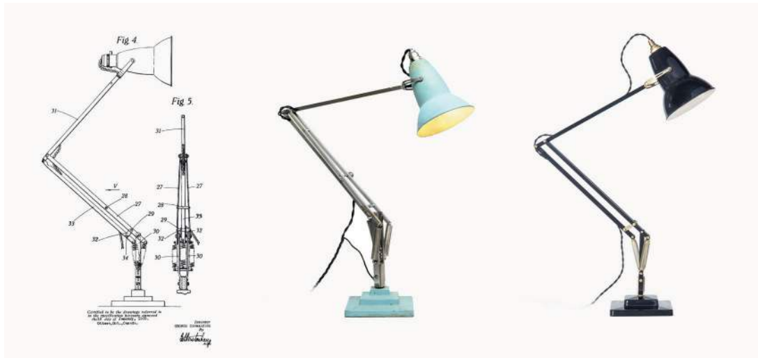
Figure 5: The Anglepoise lamp