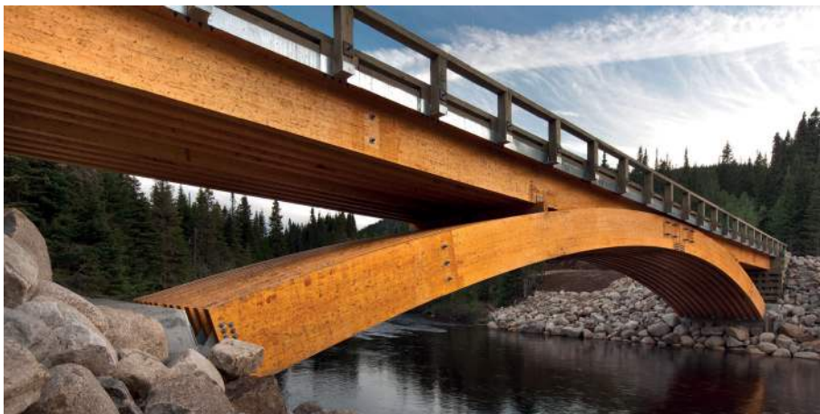
Figure 7: A timber bridge

In other cases, bridge designers have used traditional materials such as wood. Figure 7 shows a timber bridge in Canada.