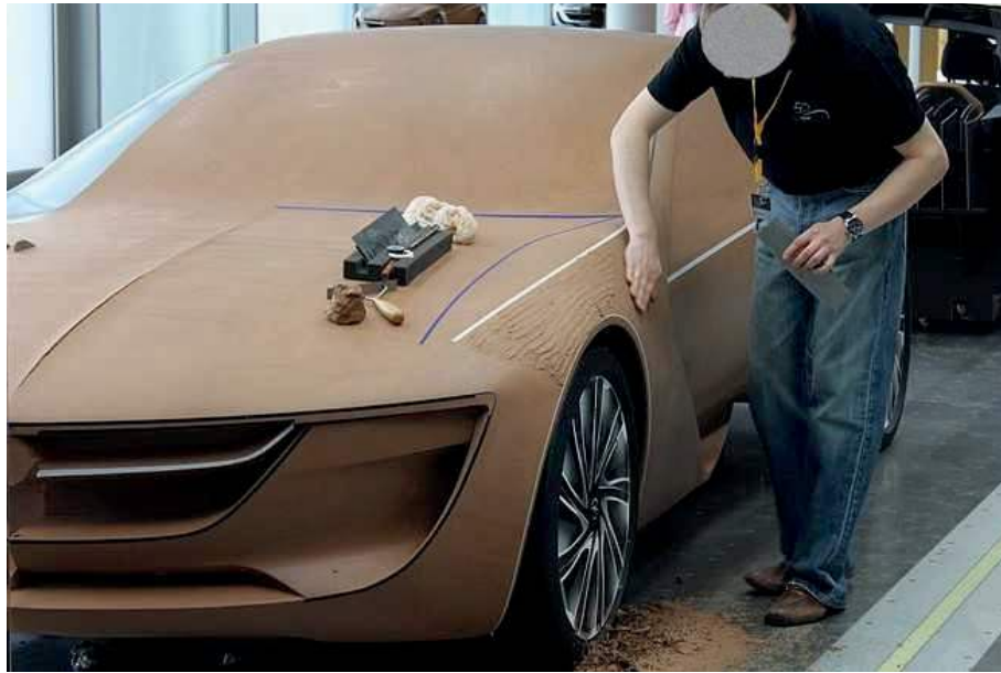
Figure 3: The use of a full-sized clay model