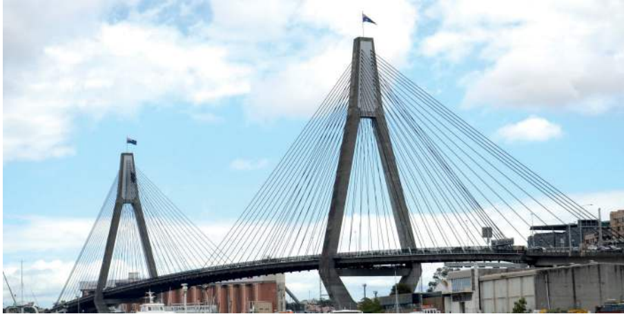
Figure 6: The Anzac Bridge