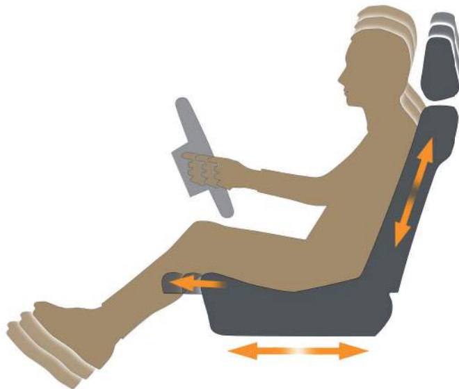
Figure 2: 2D graphics of the ergonomics of an interior