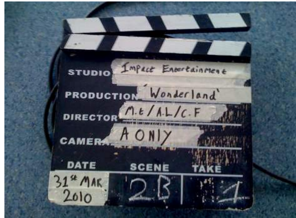
Figure 4: A traditional clapperboard