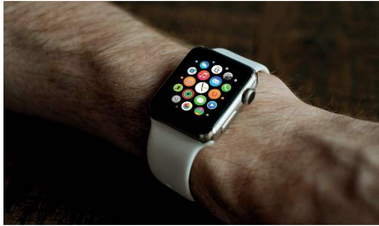
Figure 8: A smartwatch